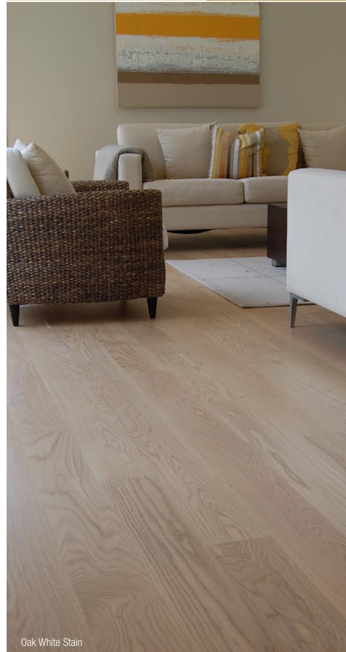
Oak White Stain